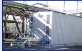
▲ Page 2 Burner Management Project