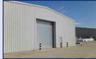
▲ Page 2 Covered Storage Area