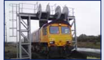
▲ Page 3 The Train Cleaner