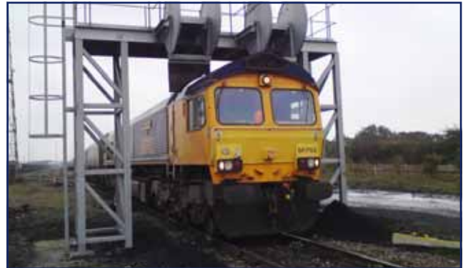
▲ Single Train Cleaner

ATC have recently been awarded the contract for manufacturing and installing a double Train Cleaner for the Port of Blythe in Northumberland.