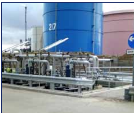
▲ Bio-Ethanol Project

ATC are well established as a preferred contractor and have worked well with the client to ensure that our staff comply at all times with the stringent Health and Safety standards required working in the petrochemical industry.