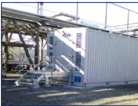
▲ Burner Management Project

Careful programming of the activities was essential to make best use of manpower and plant. It was essential that Health and Safety standards were exemplary and that coordination between ATC Supervision and LOR Process Staff was extremely efficient to minimise disruption to refinery production and ensure the safe working conditions for all staff.