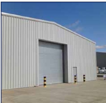
▲ Covered Storage Area

Any disruption to LOR Process Staff was kept to a minimum whilst ensuring that refinery production remained unaffected.