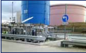
▲ Page 2 Bio-Ethanol Project